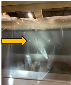
Cover Plate Installed