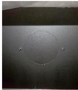
Cover Plate Installed