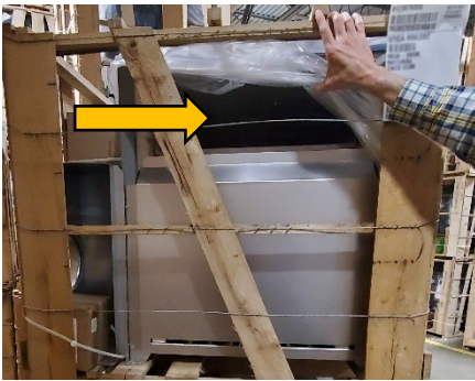
Back of Crated Boiler

Check back of boiler. Lift plastic covering or view through plastic with a flashlight. Verify if cover plate is in place.